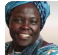
DR. W. M. MAATHAI:

"The only way out of poverty is through ethical business practice. Politicians cannot solve the problems deriving from poverty in a vacuum."