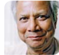
PROF. M. YUNUS: